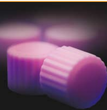
Patented Gripple ceramic rollers